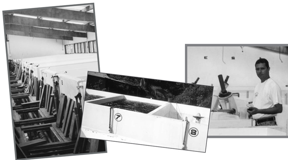
Aquamarina de la Costa Hatchery Left: Routine dry-out of one larval rearing module. Center: Cleaning an outdoor tank for mass culture of algae. Right: Metering the flow of algae into a larval tank.

There were other natural foods tested or used in larviculture, including rotifers, nematodes, and boiled egg yolks, but algae and artemia remained the foundation of feeding regimes. Maturation had been incorporated into several operations by this time, using either wild or pondraised broodstock. It was achieved through eyestalk ablation of the females – which increased the rate of maturity – and by controlling photoperiod and temperature in maturation systems. The maturation diet used consisted mainly of fresh foods supplemented with commercial pellets. A typical diet consisted of squid, marine bloodworms, oysters, clams, and a high protein pellet.