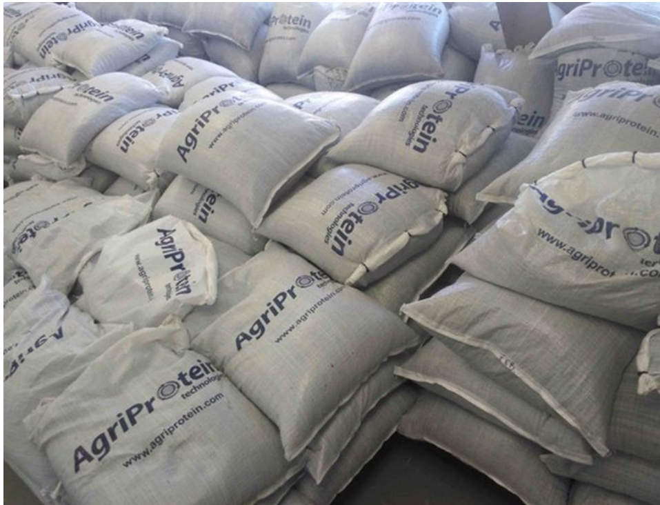
Agriprotein is a Cape Town, South Africa, business that produces an insect-based protein feed called MagMeal™.

“The cross-talk between the groups is what's really important. If you're trying to drive this forward, the group-learning is really what it's about,” he added. “The last thing you want to do, if you're getting all these smart people together, is to not have them interact with each other.”