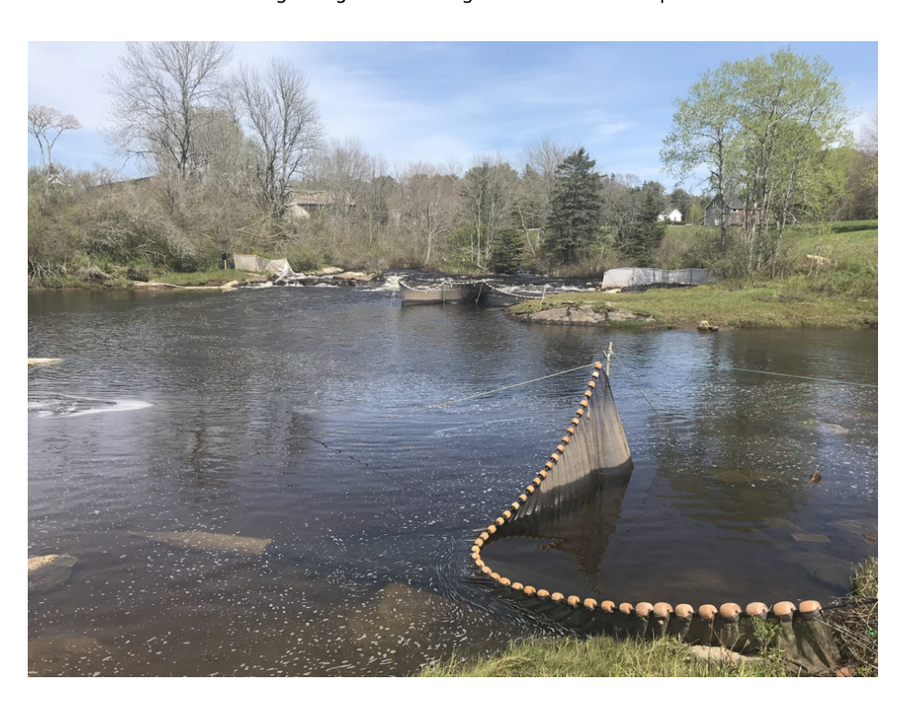
Fyke nets set up on an undisclosed Maine river to catch glass eels, or elvers, in the spring. Maine and South Carolina are the only two U.S. states that have regulated eel fisheries.

Like many eel producers, Rademaker still relies on wild seedstock, and likely always will. American Unagi has its own buyer's license this year and when she purchases the tiny, transparent elvers she pays market price, Rademaker said. In March of 2018, elver prices hit a record high at an estimated $2,700 to $2,800 (http://bangordailynews.com/2018/03/27/business/fisheries/price-offered-formaines-baby-eels-hits-record-high/) per pound.