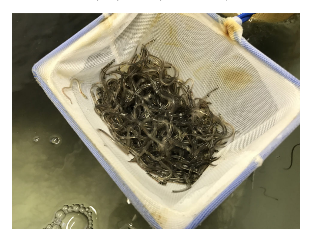
Glass eels, or elvers, at the American Unagi RAS facility in Walpole, Maine.