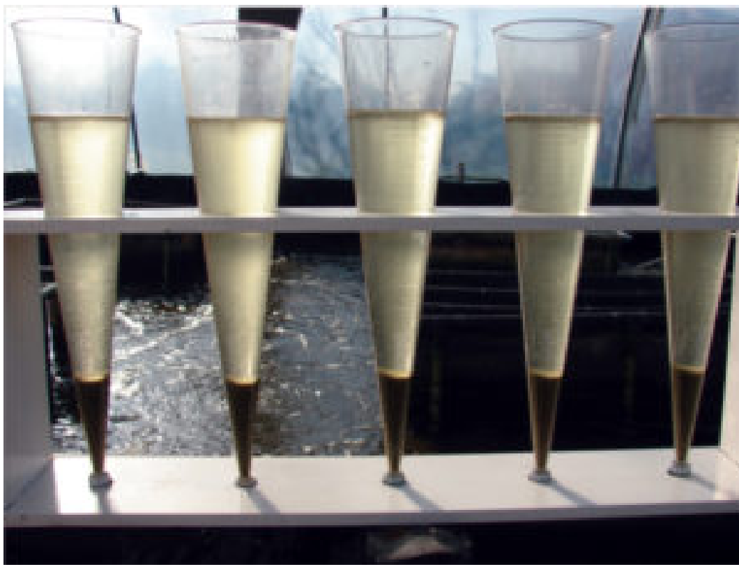
Where ammonia was added, higher amounts of settleable solids were observed.