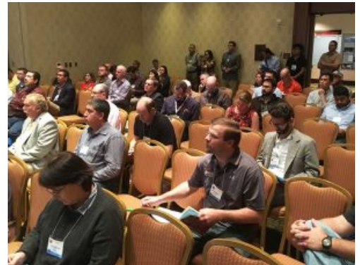
All sessions were well attended.