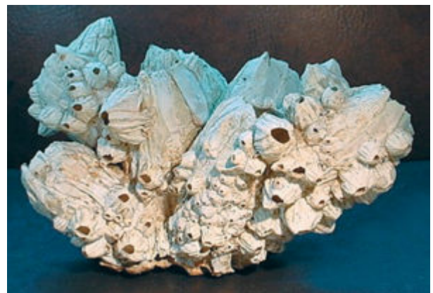
Hummock of giant barnacles.

The giant barnacle is a gregarious species that can be cultured at high densities. The animals can minimize the negative effects of crowding by modifying their shell bases, depending on substrate availability and recruitment intensity. The high growth rate of the species means it is possible to obtain commercial-size individuals with 3.5-cm carino-rostral lengths in two to three years. The barnacles are highly resistant to manipulation and extreme conditions like emersion and can therefore be transported live.