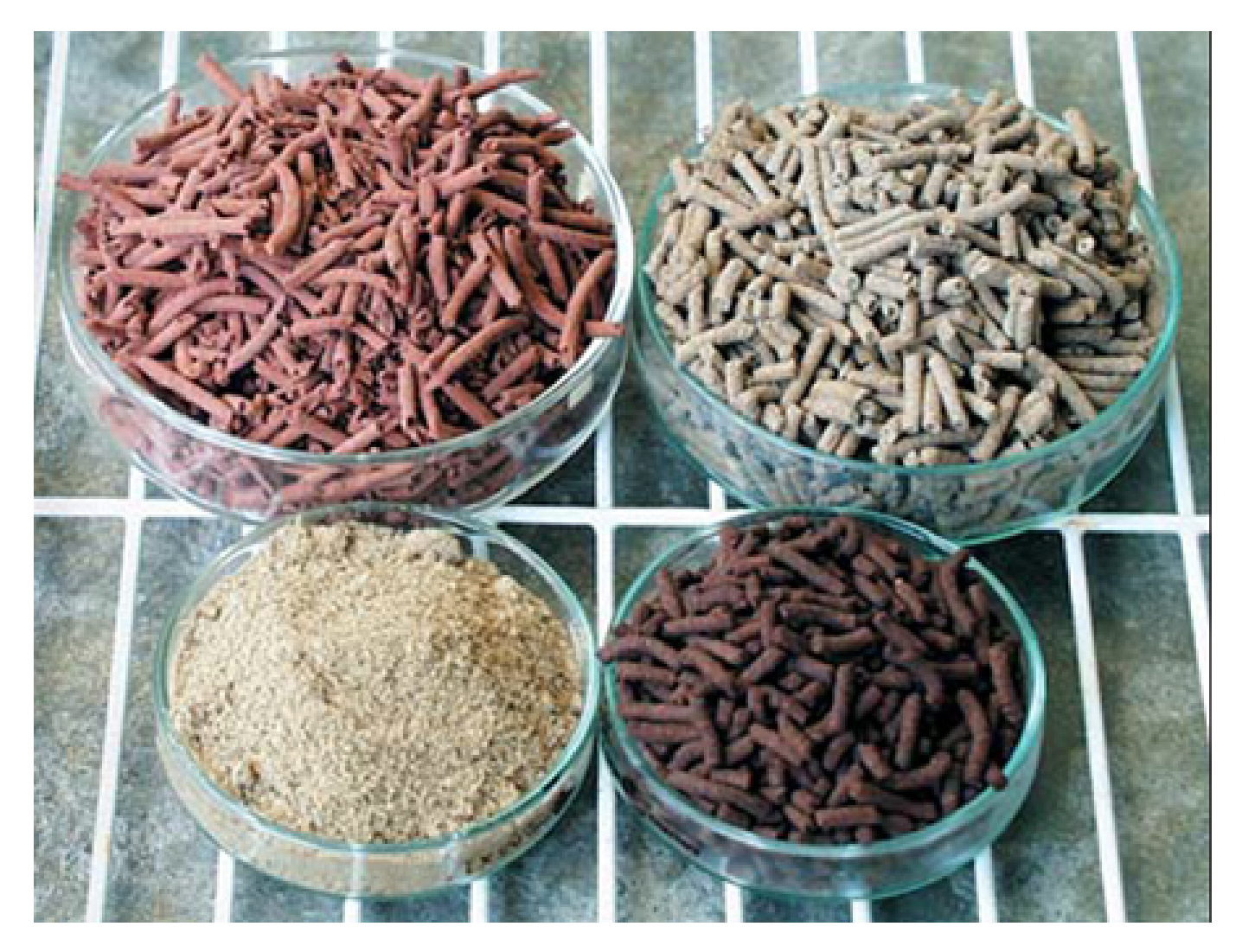
Fig. 3: Dry artificial diets, available commercially as pellets or powders, are generally not used in ratios higher than 25 percent of the total feeding regime.

to accept moist diets easier than dry diets.