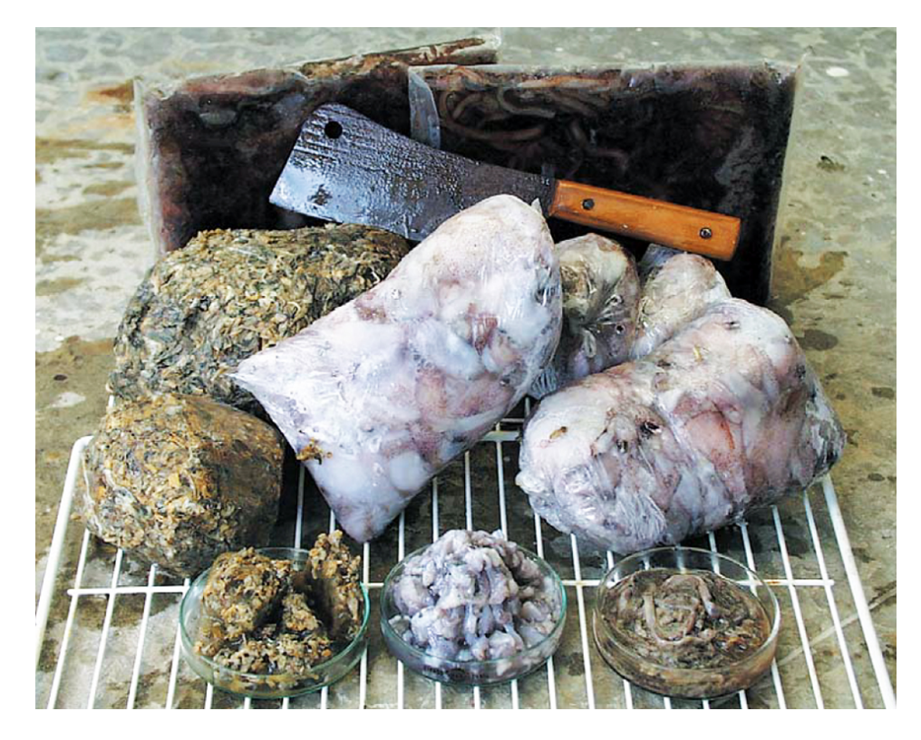
Fig. 2: Frozen fresh food, e.g. mussel, squid and bloodworm, are chopped into pieces and fed to the shrimp broodstock.