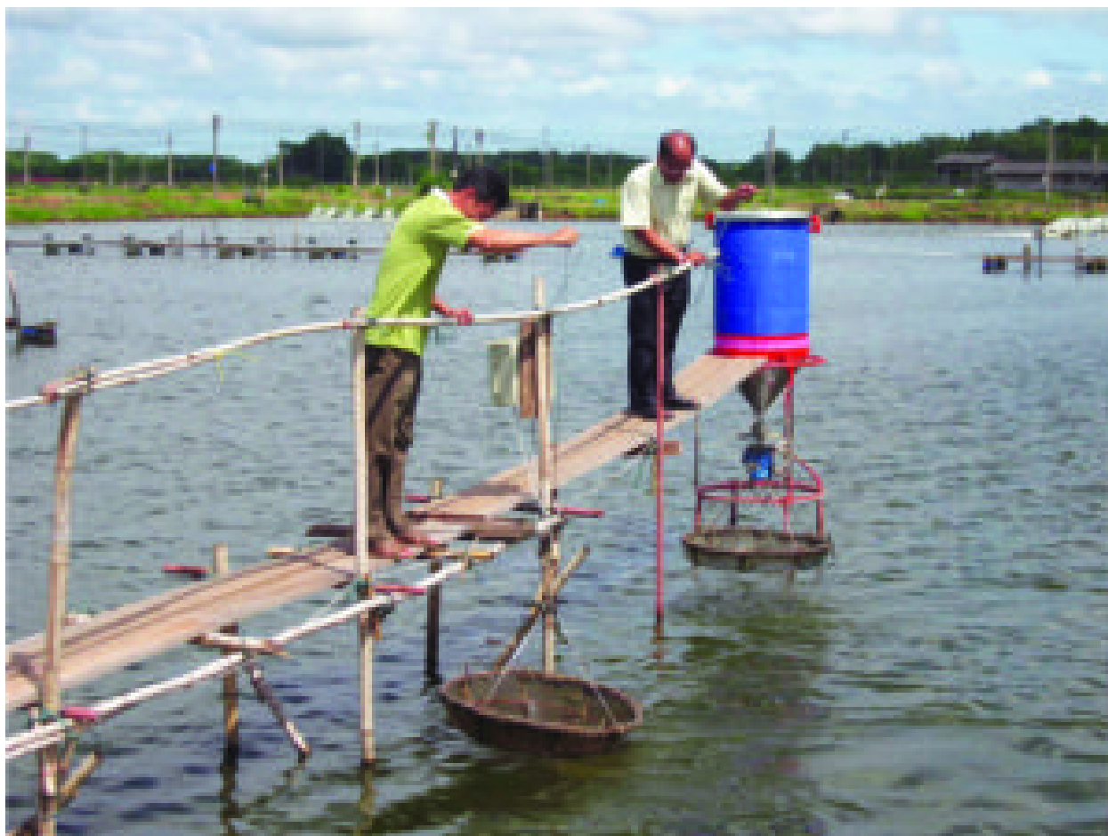
Only two trays are needed for evaluating feed consumption for each feeding machine installed.

Automatic feeders are especially suited to feeding Pacific white shrimp, which like to eat their food while swimming swiftly in the water. If small amounts of feed are dispensed over a wide area of the water surface at regular short intervals, there is little chance of finding leftover feed on the bottom of the pond. Overfeeding is thus rare during automatic feeding, and pond bottom quality is maintained to the end of the grow-out cycle.