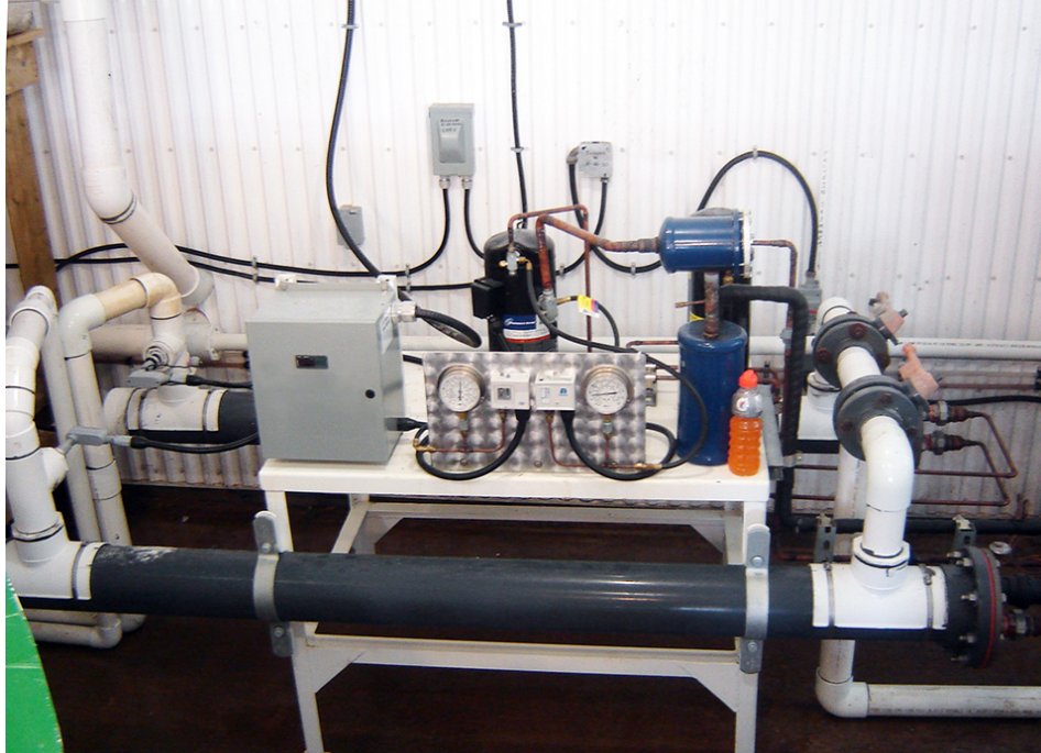
This custom-built water-source heat pump has a COP over 4.5.

Find out your chiller barrels' minimum flow rates and maintain them. Ideally, chiller barrels should be plumbed in a loop configuration to maintain flow rather than in series with other equipment. When a chiller barrel is used in series in a system with variable flow, major inefficiencies are likely, and equipment failure is possible. For optimal COP and equipment life, adhere to manufacturers' recommended flow rate ranges.