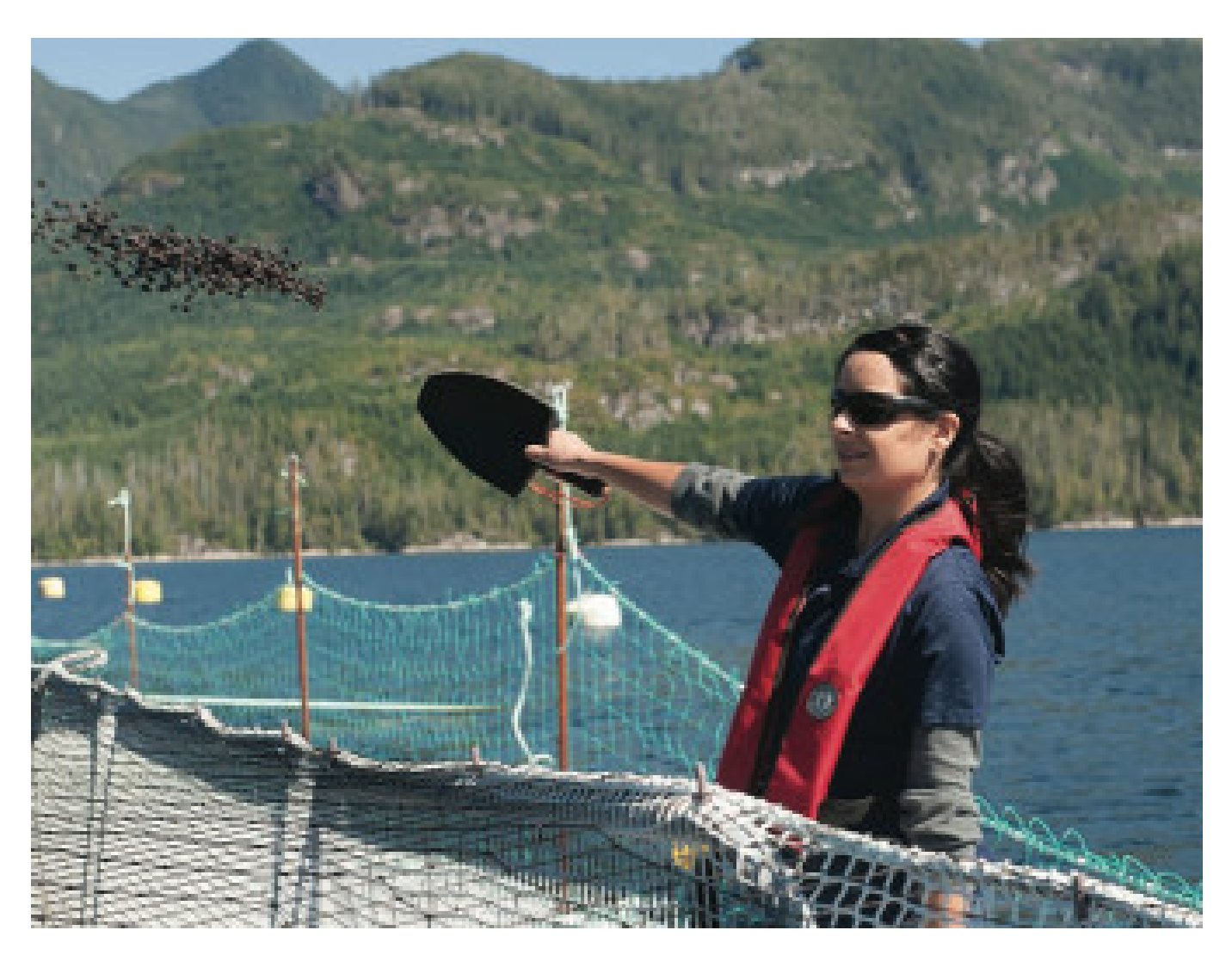
British Columbia's salmon farming industry's forage fish dependence ratio (FFDR) has decreased from 7.2 kg to 1.5 kg (per kilogram of farmed salmon) for fish oil and from 4.4 kg to 0.23 kg for fishmeal.

forage fish dependence ratio (FFDR) has decreased from 7.2 kg to 1.5 kg (per kilogram of farmed salmon) for fish oil and from 4.4 kg to 0.23 kg for fishmeal