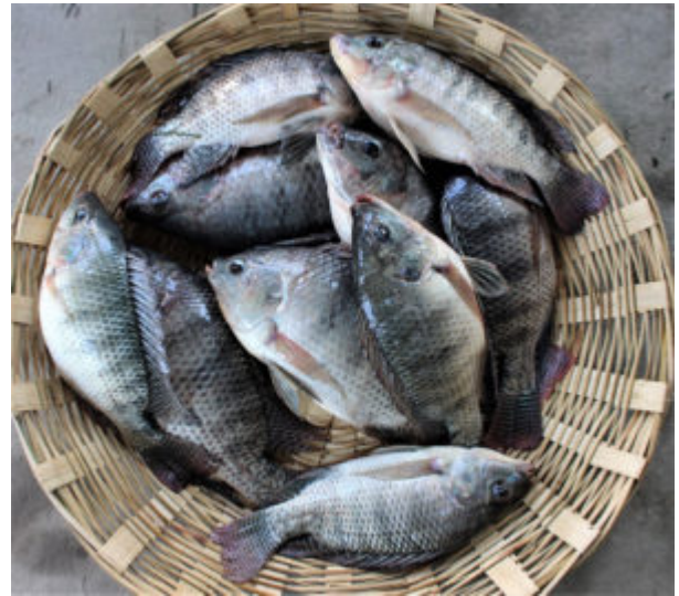
Improved GIFT strain of tilapia.

This was followed by dissemination of these improved strains and adoption of low-cost and appropriate breeding and aquaculture technologies in a large number of tilapia hatcheries and farms within a span of 11 years (2005 to 2015), during which tilapia production increased more than 18-fold in Bangladesh (Fig. 1).