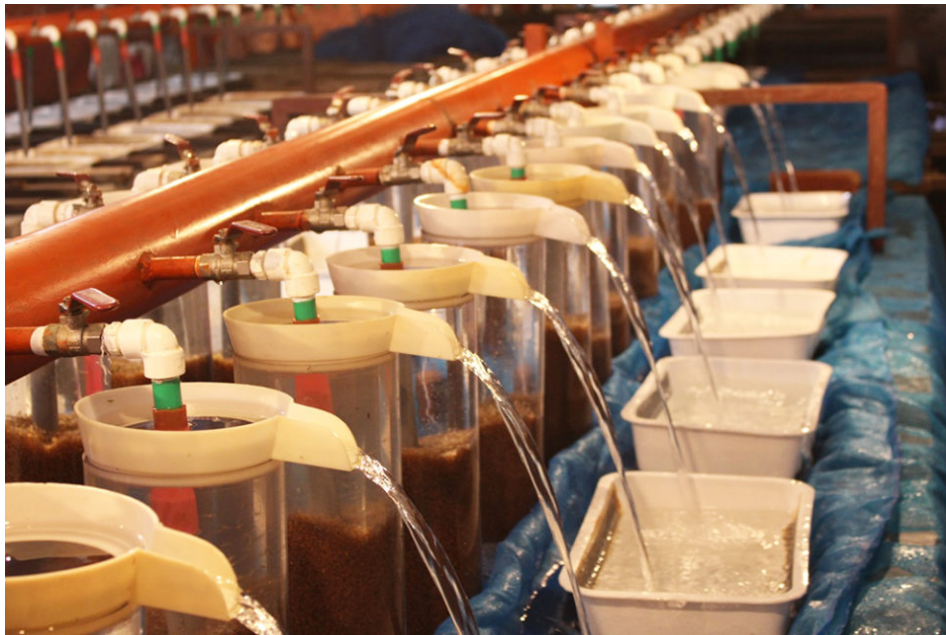
Tilapia egg incubation system in a commercial tilapia hatchery in Bangladesh.