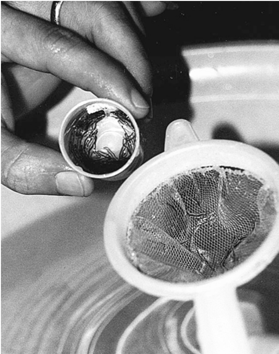
Collecting postlarvae for diagnostic evaluation.