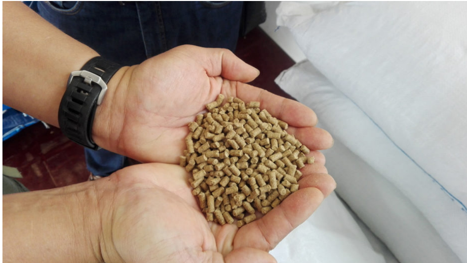
Sample of tilapia feed used in China.

Bio-economic modeling, which integrates detailed modeling of fish growth with financial analysis, can help farmers optimize their farming and business arrangements under ever changing climate, technical and market conditions. It represents a knowledge-based innovation that can improve the technical and financial performance of aquaculture under given farming conditions.