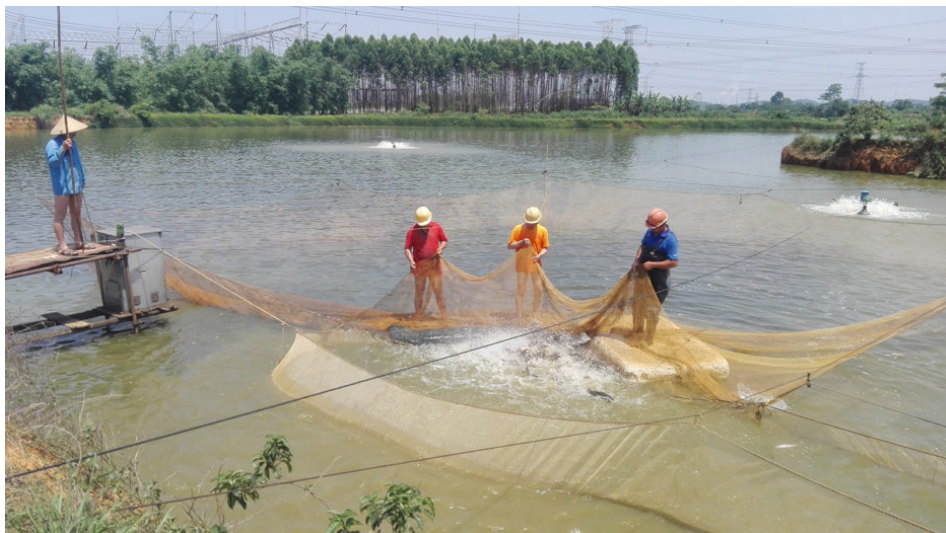
Harvesting tilapia from a pond in China.

Integrating fish growth with financial analysis can help farmers optimize operations