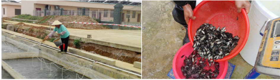
Good-quality fingerlings are very important. Nursing tilapia fry (left). Tilapia fingerlings being weighed before stocking (right).

Under these preset technical requirements, a farming arrangement is to decide four technical parameters: stocking timing, fingerling size, stocking density and growing period. Stocking timing matters because the bio-economic model accounts for seasonal variation in the water temperature. Crops starting at different stocking timings are subject to different water temperatures hence have different fish growth patterns.