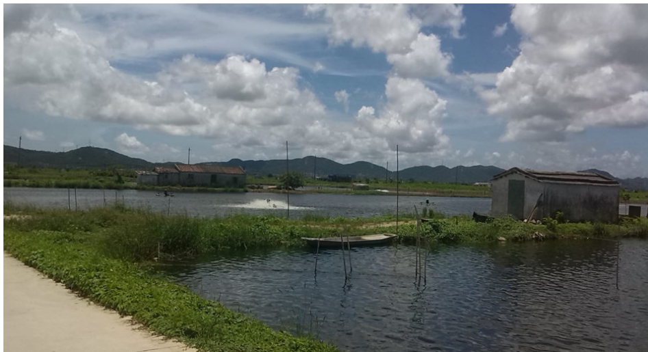
View of tilapia ponds.

Detailed discussion on the methodology and results of the bio-economic model can be found in the Fisheries and Aquaculture Technical Paper No. 608 ( http://www.fao.org/3/i8442en/i8442EN.pdf ). (Cai, J.N., Leung, P.S., Luo, Y.J., Yuan, X.H. & Yuan, Y.M. 2018. Improving the performance of tilapia farming under climate variation: perspective from bio-economic modeling. Rome, FAO).