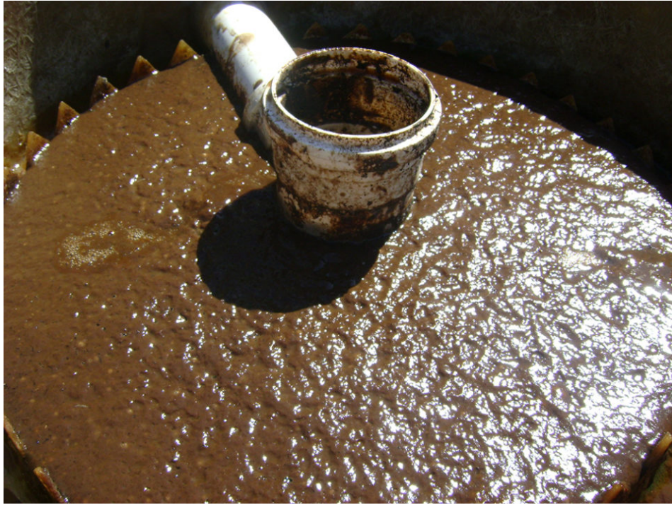
Biofloc in the settling chamber of the activated sludge system.