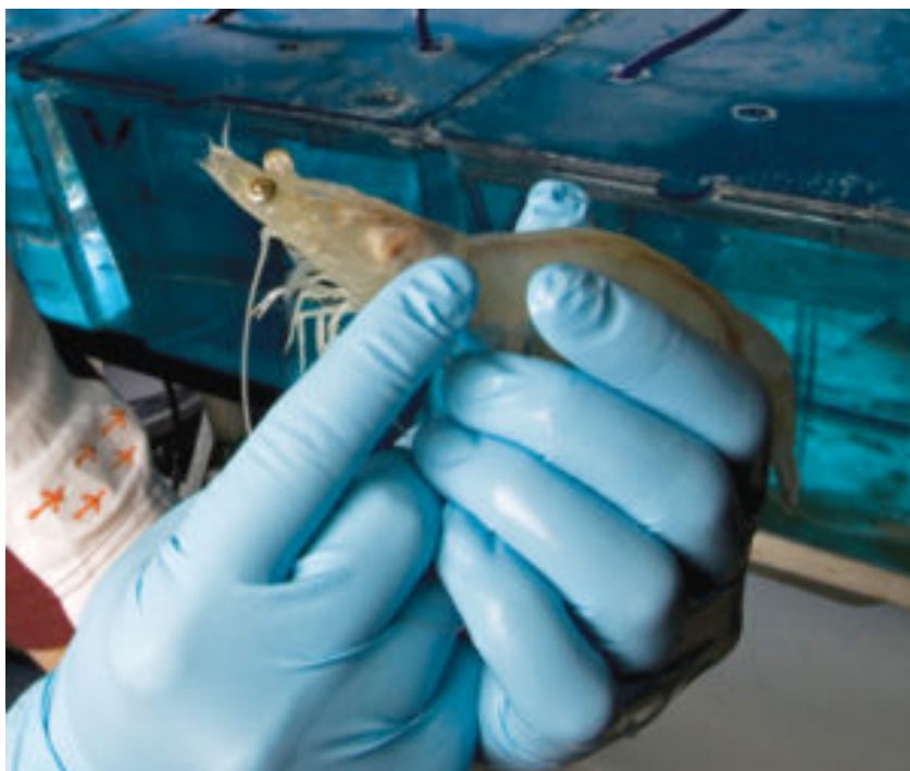
A researcher at Virginia Tech investigates the condition of a shrimp during an experimental trial.

Shrimp farming has traditionally relied on fishmeal for the formulation of nutritionally complete diets. However, fishmeal is becoming more expensive, and natural fisheries are being overexploited due to an increase in demand as the global human population continues to grow. This is prompting the aquaculture industry to investigate and implement alternative sources of protein to replace less-sustainable protein ingredients for aquaculture feed.