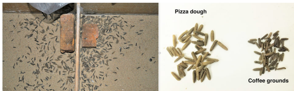
Fig. 3: Left: pre-pupae that just migrated up the 45-degree-angle side and fell into the trough with some sand to cushion the fall and facilitate harvesting. This was the third day from initially observing the pre-pupae.

Within a week, the first pre-pupae [life stage of some insects before transformation to other stages] larvae were observed to climb up the 45-degree sides and fall into the trough harvester, which had quarter-inch of sand to help soften the impact as well as to facilitate harvesting with scoop nets. Pre-pupae larvae were much larger when cultured on pizza dough (length 1.75 \pm 0.04 cm; width 0.43 \pm 0.02 cm) compared to those grown on coffee grounds (length 1.27 \pm 0.03 cm; width 0.29 \pm 0.01 cm), likely due to the dough being softer and richer in easily digestible starches (Fig. 3). It should be noted that not all the larvae migrated to be harvested, but the majority did.