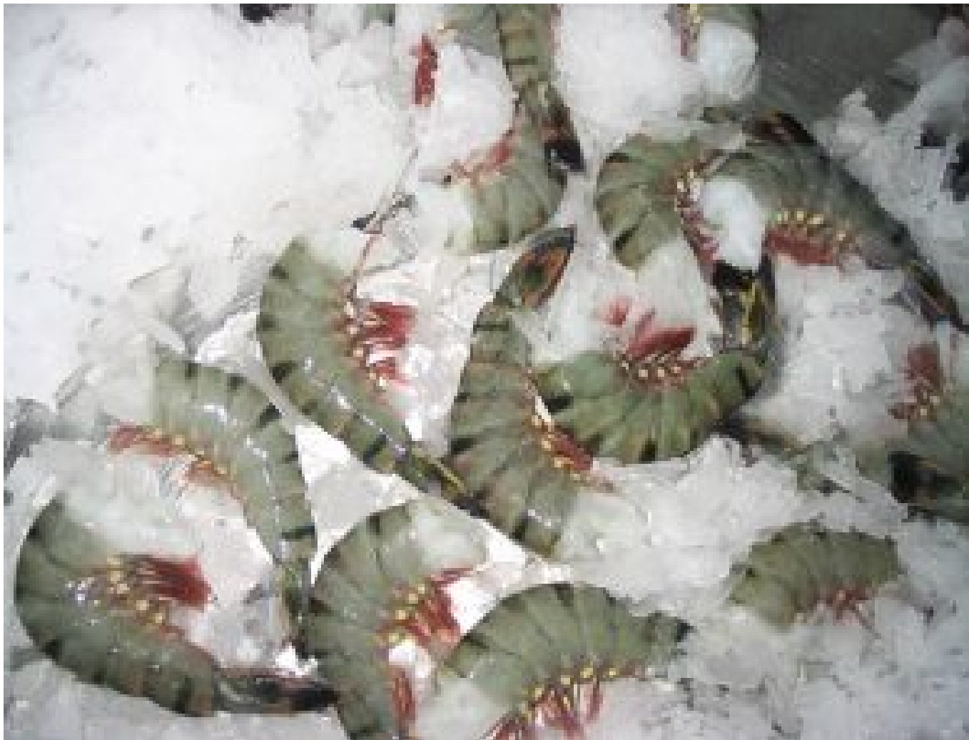
Proper temperature control of harvested shrimp is critical for product wholesomeness and quality.

During freezing and deep freezing, the water in the product solidifies to ice. At temperatures below -18 degrees-C, development of all microorganisms and biochemical changes are stopped, which results in frozen products having shelf lives from several months to more than one year. The quality of the product depends on the quickness to lower the temperature of the product to any point below -18 degrees-C, to crystallize all the water contained in the product.