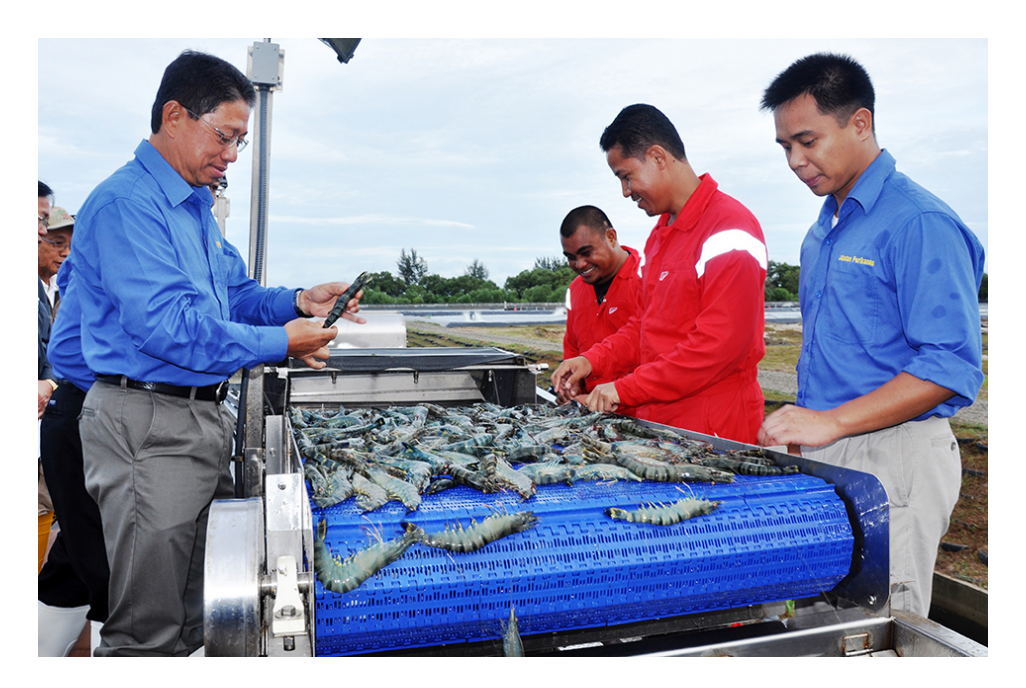
During a recent visit, Brunei Minister of Industry and Primary

The carousel design incorporated a central plastic curtain to partially divide the pond lengthwise, facilitating raceway-type water flow. While the self-cleaning efficiency of circular ponds declines with increasing pond diameter, raceways have the potential to be scalable without change in water circulation. To increase the self-cleaning aspect of this design, Venturi water jets were installed at intervals along the pond bottom.