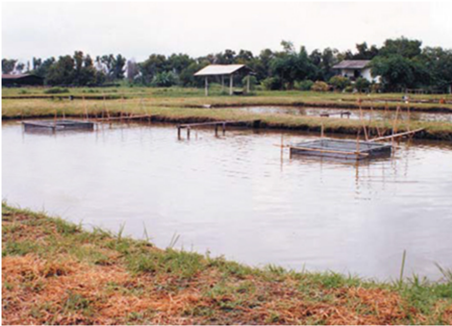
Nile tilapia culture in an integrated cage-cum-pond system.