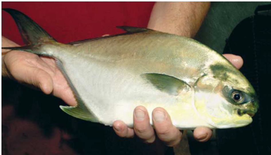
Florida pompano ( Trachinotus carolinus ).