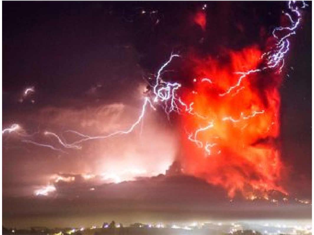
A snapshot of the natural spectacle last year in Chile, when the Calbuco Volcano erupted.

It's still too soon to tell if a new vaccine