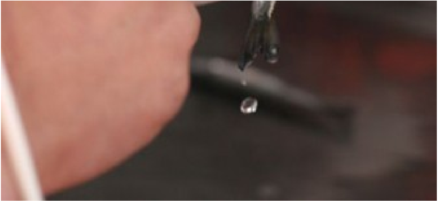
It attenuated live vaccine Alpha Ject LiVac® SRS received a provisional marketing authorization from the Chilean authority Servicio Agrícola y Ganadero de Chile.