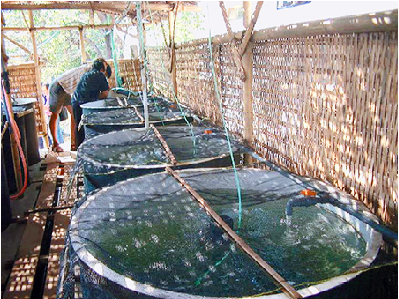
Feed trials at the Brackishwater Aquaculture Development Center in Indonesia examined cholesterol's impact on shrimp feed.