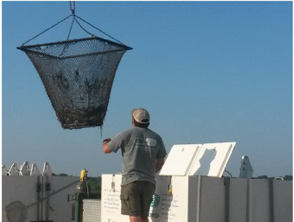
Hybrid catfish being loaded out for stocking of private ponds and lakes.