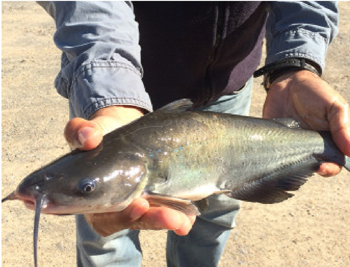
Hybrid catfish have been raised in an in-pond raceway system to supply niche markets.

The design of the IPRS makes harvest of small amounts of fish (<450 kg weekly) feasible from the standpoint of labor, time, and cost. Since fish are confined to raceway cells that are easily crowded and harvested, a significant reduction in labor cost has occurred compared to harvesting larger traditional levee ponds. This has made it economically feasible to