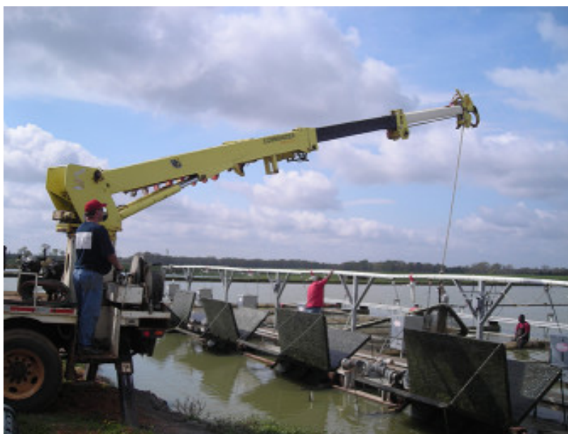
Partial harvest of an in-pond raceway in Browns, Alabama.

stocking densities of the raceways. Fish were fed a commercial, floating feed (32 percent protein, Alabama Feed Mill, Uniontown, Ala., USA) 2 – 4 times per day based on biomass, water temperature, and fish size. Catfish were harvested throughout the study as they reached marketable size (Fig. 3 & Fig. 4). Due to the ease of harvest, a range of sizes were sold based on customer demands.