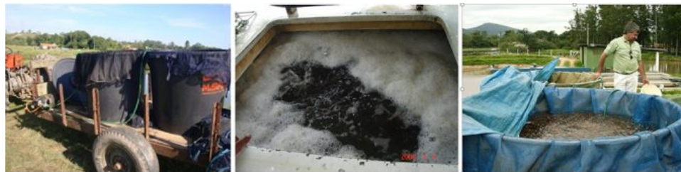
Fish can be treated for parasites inside hauling tanks, before transferring them to new ponds or to other farms. Aeration or oxygenation has to be provided during the treatment. Placing a soft-mesh hapa inside the hauling tanks will allow the rapid removal of fish from the bath.

This initial test gave us confidence to apply the treatment to the whole population of fish. We seined half of the pond and rapidly loaded the fish into two hauling tanks with salted water at 50 kg salt/m 3 and hapas and oxygen diffusers assembled inside (Figure 5). Fish behaved exactly the same way we have seen previously during the test. After 3-min in the salt bath, we rapidly transferred the fish to a hapa set up in a new pond. By lowering one side of the hapa under the water, we could observe the fish recover and swim freely into the pond. Very few dead fish remained in the hapa. Then, we repeated the process seining the whole pond and treating the second batch of fish the same way. Fortunately, nearly all the fish survived the treatment and the Piscinoodinium infection was effectively controlled with this single and highly concentrated salt bath.