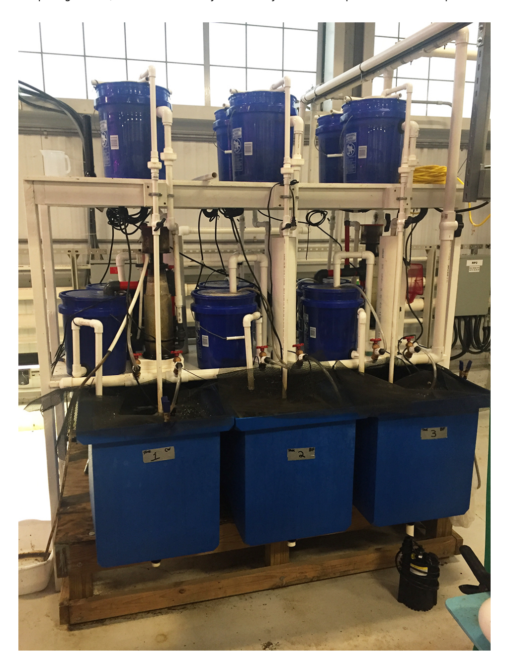
View of the experimental system used in this study.

Tilapia fry (mean initial weight of 0.17 grams) produced from YY males sourced from Louisiana Specialty Aquafarm (Robert, Louisiana, USA) were stocked at 55 fish per tank (305 fish per cubic meter). During the experiment, the fish were fed commercial crumble feeds (55 percent crude protein, 15 to 17 percent crude fat) from Zeigler Bros., Inc. (Gardners, Pa., USA), and Rangen Inc. (Buhl, Idaho, USA). Feeding rations started at 10 percent of fish weight per day and gradually decreased to 5 percent per day. All tanks were fed the same amount, regardless of treatment, and feed was provided at evenly spaced intervals three times per day.