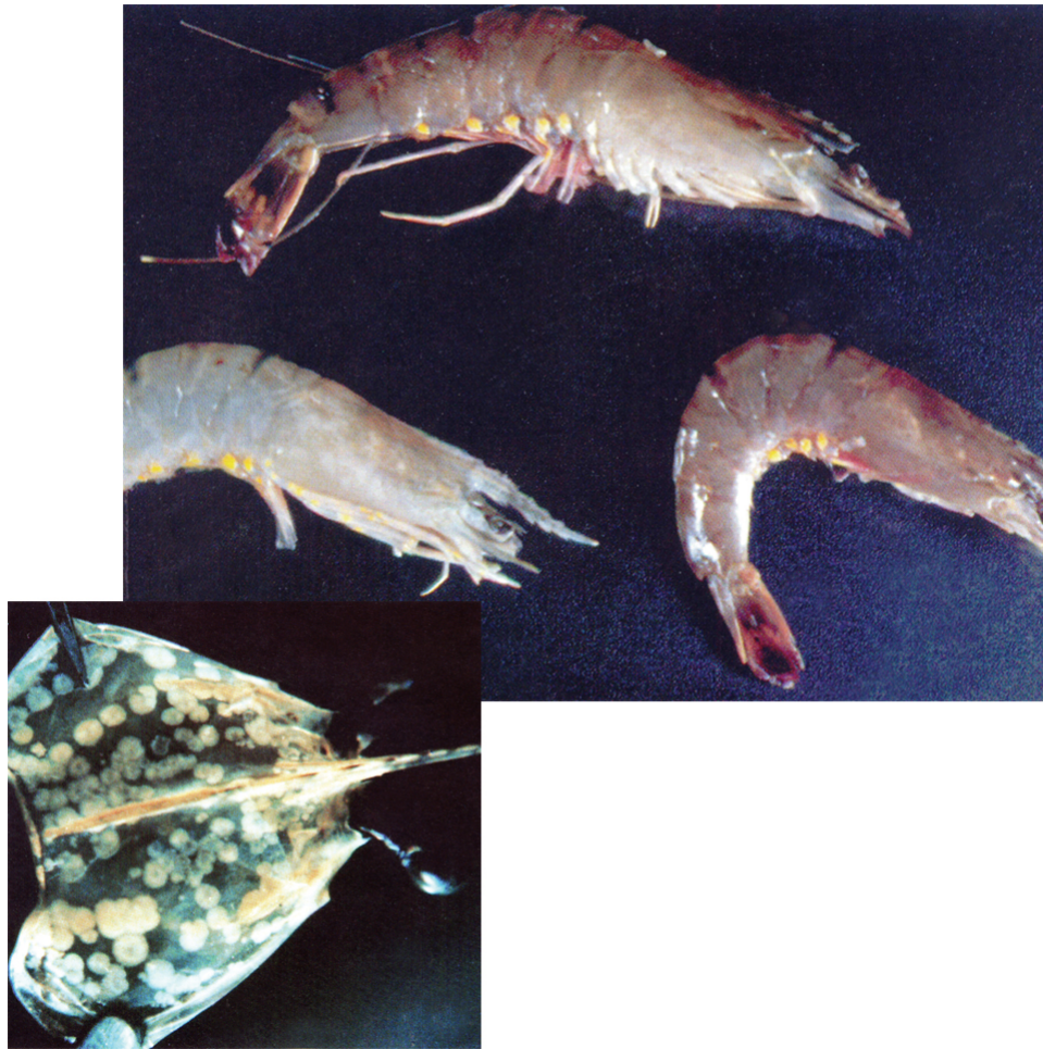
Multiple white spots characterize White Spot Syndrome in shrimp. Although it initially caused serious losses in Asia only, WSSV is now the most serious shrimp pathogen worldwide.