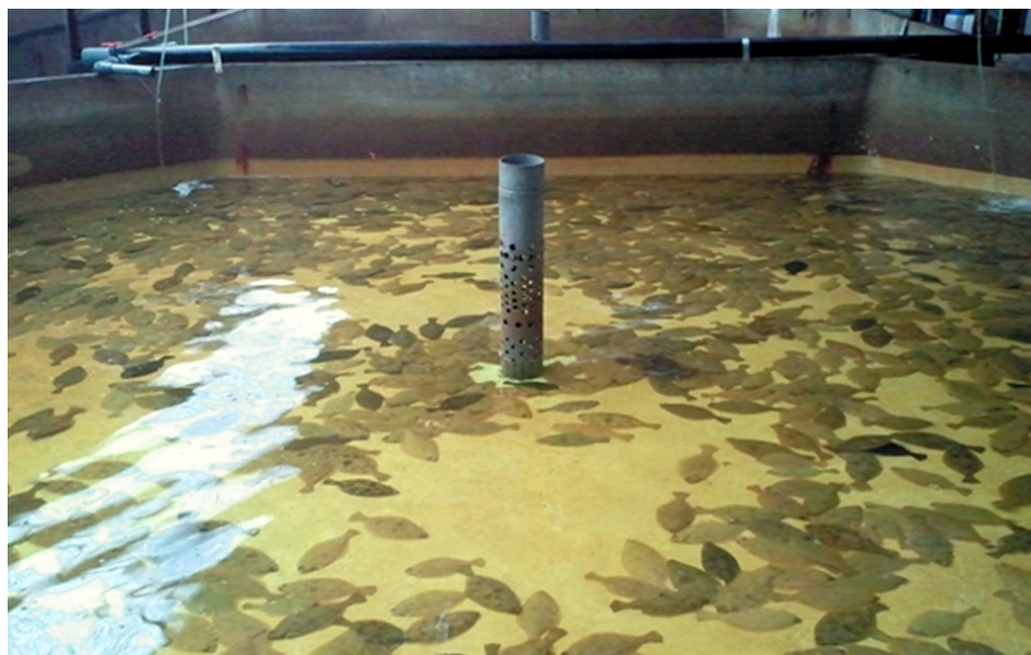
Juvenile flounders are grown at high densities in indoor tanks.

The authors conducted research to evaluate the effects of two different organic acid blends on the performance, gut microbial bacterial composition and resistance to Edwardsiella tarda infection in olive flounders. E. tarda is a common pathogen that causes significant losses in the culture of marine fish.