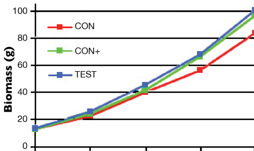
Fig. 1: Total tank biomass (average from triplicate tanks) of P. monodon fed 56 days on experimental feeds (trial 2).

Overall shrimp survival was lower in trial 2, averaging 77 to 85 percent. However, the trends in growth response observed in this independent trial – run with different shrimp and different batches of raw materials for feed preparation – generally matched those of the first trial (Figure 1).