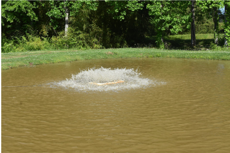
One of the 0.5-hp Air-O-lator aerators used in this study, showing water being splashed into the air during operation.

Pond aquaculture is becoming increasingly intensive. Resultingly, more feed is used, which results in a large oxygen demand. Water exchange can be used to avoid low dissolved oxygen concentration (DO), but it is more efficient to apply mechanical aeration.