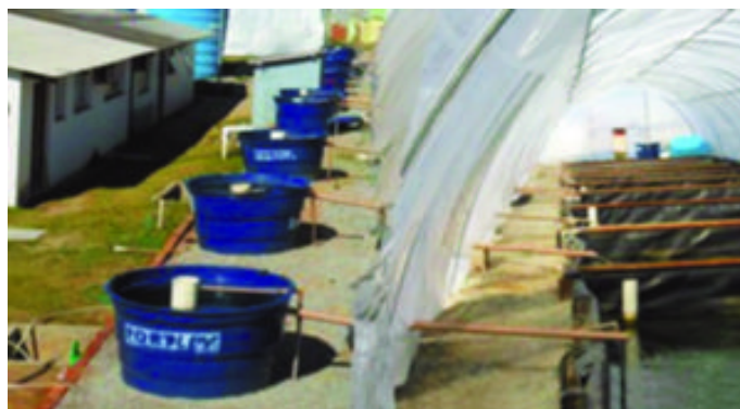
Greenhouse shrimp production with linear tanks.

In another experiment that used the biofloc inoculum, it was observed that when the concentration of dissolved oxygen was maintained above 5 mg/L, the suspended solids excess was not a problem for the respiration of the reared shrimp. Considering the interactions of water quality parameters listed above, maintenance of the suspended solids levels is required for better water quality. Values for common water quality parameters measured under two average TSS concentrations are shown in Table 2.