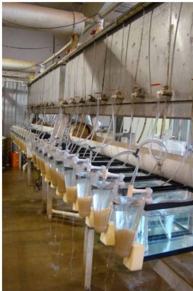
Hatching experiment at Keo Fish Farms, Inc.