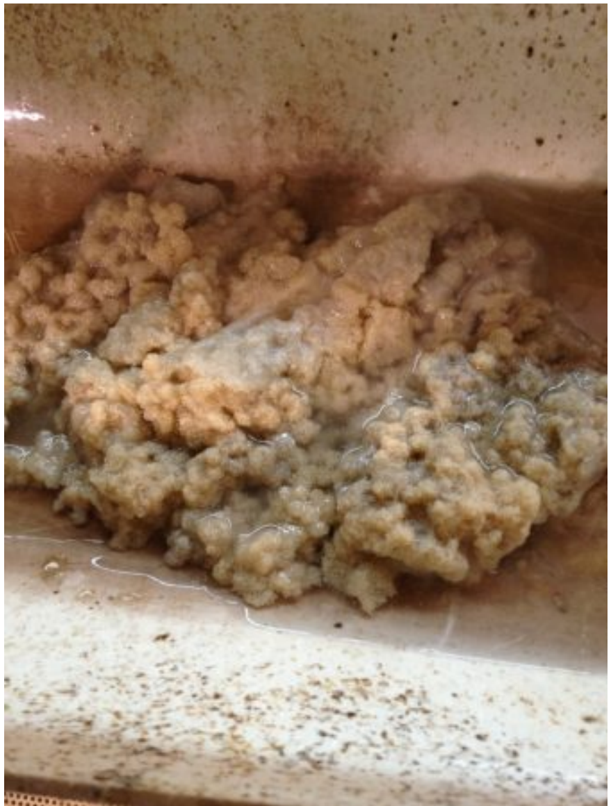
Fungal growth is a significant problem during fish egg incubation.

In our study – here summarized from the original publication ( North American Journal of Aquaculture 78:243–250, 2016) – we carried out an in vitro experiment to determine the concentration of \text{CuSO}_4 that would control fungal growth on culture media followed by an acute toxicity experiment to define the safe and lethal concentrations for sunshine bass larvae. We also conducted an experiment at a commercial sunshine bass hatchery to determine the ideal treatment concentration of \text{CuSO}_4 to control saprolegniasis on sunshine bass eggs.