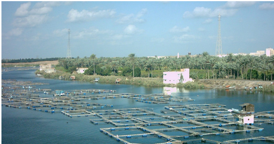
View of tilapia farming cages in Egypt.

Tilapia culture in Egypt is practiced mainly by the private sector, using simple farming technologies. Small farmers, mostly illiterate or with limited education, are nevertheless the driving force of tilapia production. These farmers have gained broad and significant experience through trial and error, and can efficiently apply this know-how.