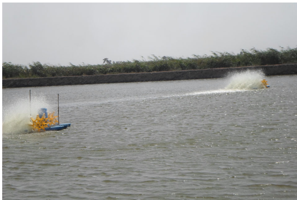
View of typical earthen pond with aeration used for tilapia mono- and polyculture in Egypt.

Nile tilapia are reared both semi-intensively in earthen ponds and intensively in cages, ponds and concrete tanks, and in integration with terrestrial crops. Under the semi-intensive production system, both tilapia monoculture and polyculture with carps and mullets are commonly practiced.