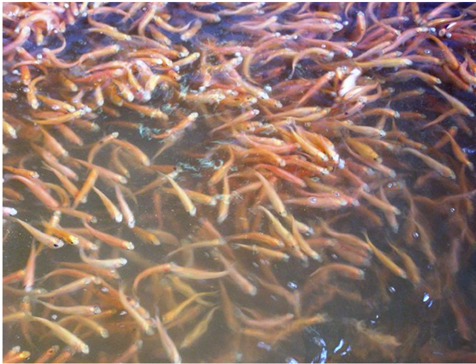
Rosy red fathead minnows are commercially important baitfish in North America.

The fathead minnow ( Pimephales promelas ) is an important baitfish species that is commercially cultured in the United States, with about 100 commercial farms producing a total of 1.5 million tons (622 million individual fish) worth nearly $10 million, per the last U.S. Census of Aquaculture in 2013.