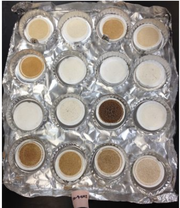
Samples prepared for total suspended solids analysis.