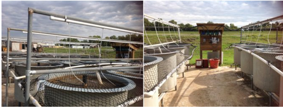
Views of the experimental system used in the study.

months, and evaluated stocking density effects on these fishes when reared in BFT systems.