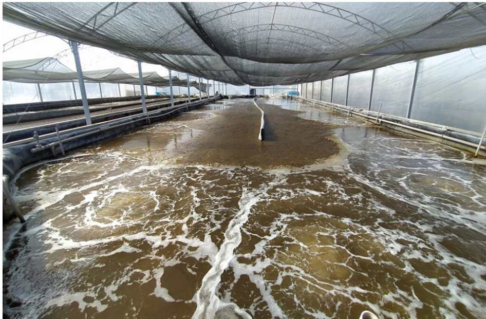
Fig. 2: View of a greenhouse where L. vannamei are reared in a BFT system at Marine Station of Aquaculture (EMA), where the animals and biofloc inoculum for this study were obtained.