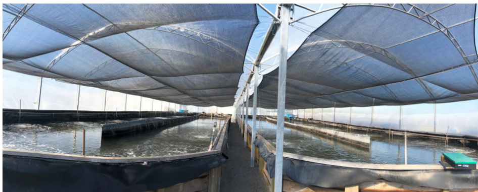
View of the lined, greenhouse enclosed raceways used in this study.

The 70-day grow-out study was carried out at the Marine Station of Aquaculture, Federal University of Rio Grande (FURG) in Southern Brazil using nine, 35,000-liter, lined raceways enclosed in a greenhouse. L. vannamei juveniles ( 1.02 \pm 0.11 grams) were stocked in the raceways at a density of 400 shrimp per square meter.