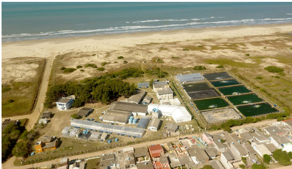
Aerial view of the Marine Station of Aquaculture, Federal University of Rio Grande (FURG).