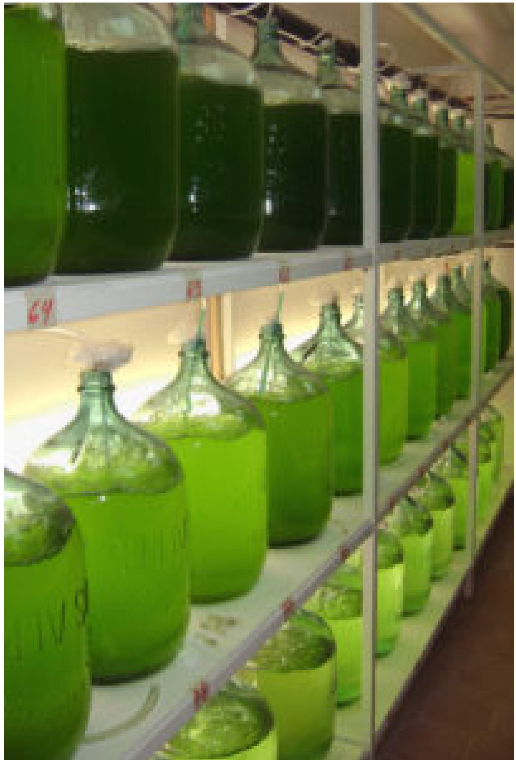
Microalgae for the study were raised in glass bottles and translucent bags.

After 20 days of culture, the highest survival, 42 percent, was obtained in tanks with larvae fed the HUFA-enriched artemia, while the survival of larvae fed the mixture with fish oil and yolk egg was 20 percent. Growth rates between the two treatments showed significant differences, with larvae fed the HUFA-enriched artemia significantly longer ( P \leq 0.05 , Table 2).