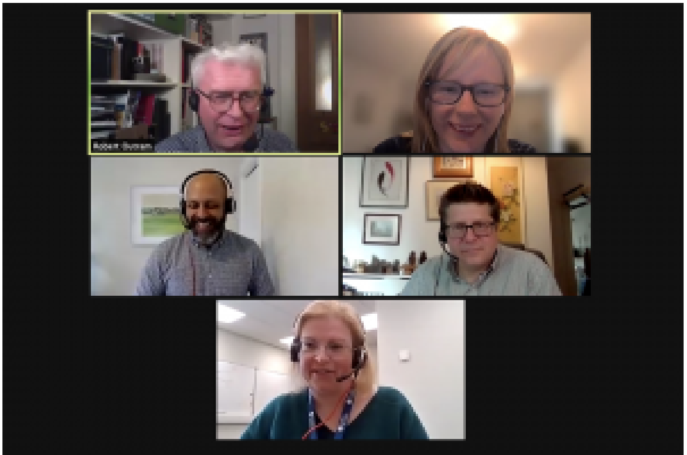
How will climate change impact the aquaculture sector? During a recent webinar, panelists discussed impacts to insurance and how data is driving decision-making.

Webinar addressed the cost of adapting to climate change as well as mitigation strategies and emerging business opportunities