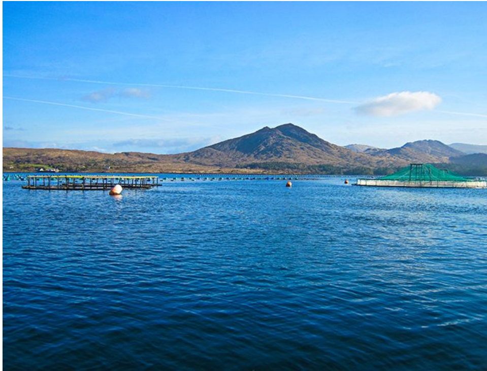
A fish pen in the Bay of Kilmackilogue, Ireland. Salmon farmers need marine waters of a certain temperature to optimize fish health and harvests. Satellite data provided by the European Space Agency is being made available to the aquaculture sector.

Informational requirements for aquaculture operators vary on location, species, business goals and other factors.