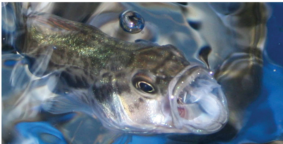
Largemouth bass ( Micropterus salmoides ).