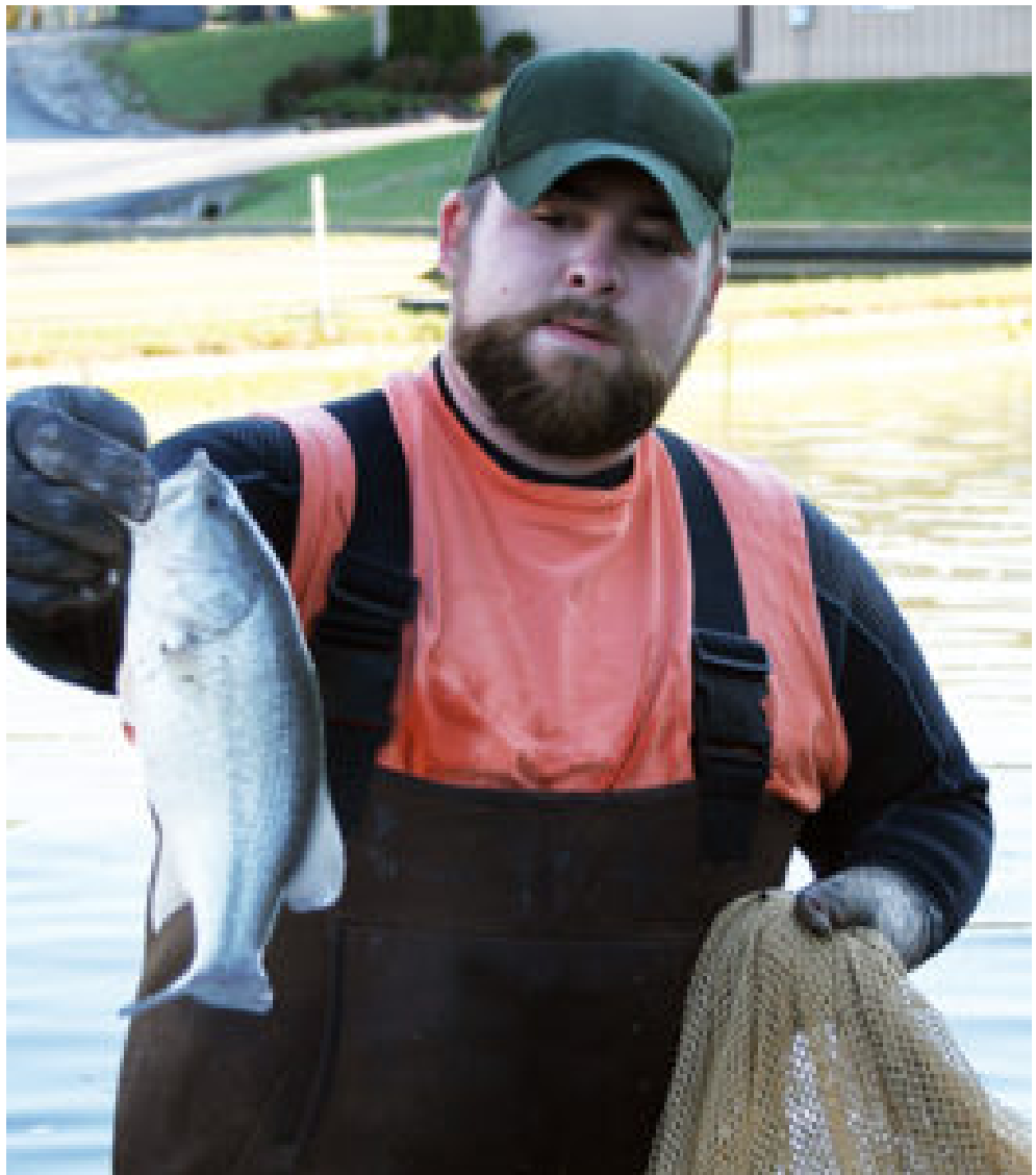
This 0.5-kg bass is ready for the live fish market.

Nesting sites should be prepared with gravel boxes or commercial artificial spawning substrates placed 3 to 6 meters apart at water depths of 0.5 to 1.0 meter, close to the pond bank to allow ease of observation. Spawning ponds are managed for water clarity, as it is important to observe fry activity.