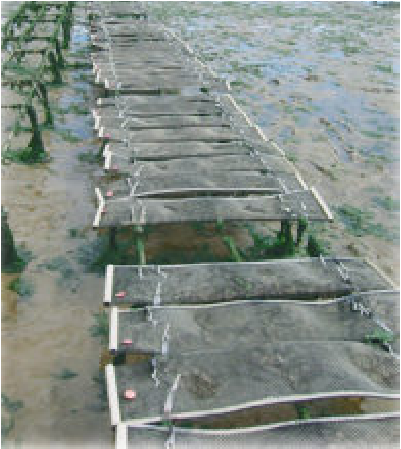
Field tests of the Morest Pacific oyster families took place in the Marennes-Oléron Bay and two other sites in France.

Despite its growing economic importance, aquaculture production of Pacific oysters ( Crassostrea gigas ) has not benefited much from genetic improvement. To date, the most significant genetic advance for the production of this species resulted from the development of polyploids. Triploid oysters