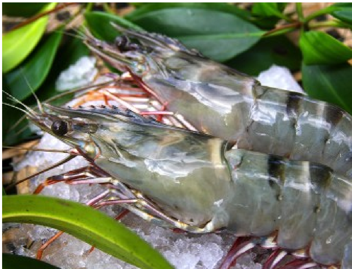
Black tiger shrimp from Vietnam's Ca Mau region.

Mangrove deforestation from shrimp farming has been on the radar of