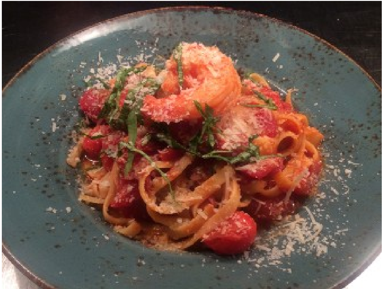
One of Chef Ned Bell's dishes featuring Selva Shrimp from Vietnam.

industry dogged by long-standing concerns over mangrove destruction, chemical use, pollution, murky supply chains and even modern-day slavery, Selva Shrimp brings a breath of briny fresh air to the marketplace.