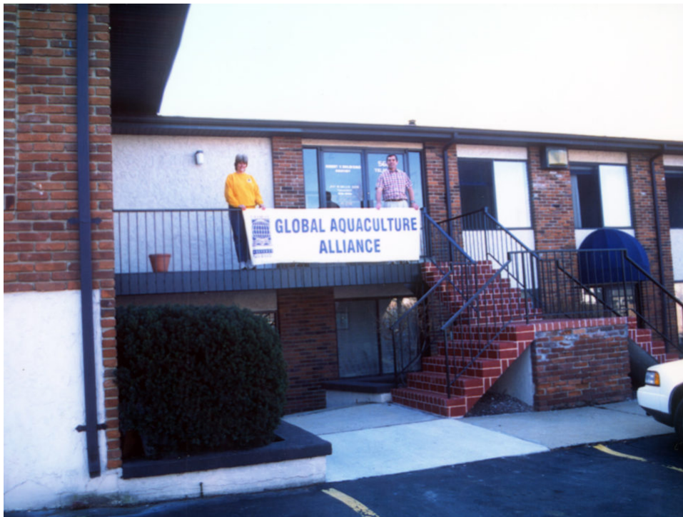
The Global Aquaculture Alliance's first office in St. Louis, Mo., USA.

The Global Aquaculture Alliance ( https://www.aquaculturealliance.org/?_hstc=236403678.3eb49bdaf86b6b3d7f9847523d525298.1680659230174.1680659230174.1680659230174.1&_hssc=236403678.1.1680659230175&_hsf )