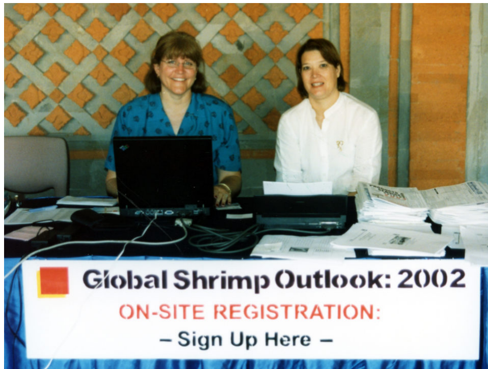
The registration booth at the Global Shrimp Outlook conference in 2002.