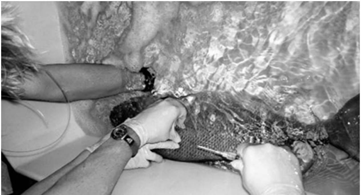
An anesthetized mutton snapper is injected with antibiotics as part of a prophylactic treatment.

Potential ectoparasitic infestations normally found in the skin, gills, and bucco-pharyngeal area should also be treated during the quarantine period. A natural pepper extract commercially available in liquid form has been successfully used to induce detachment of ectoparasites through either a long-term