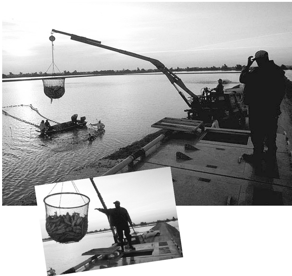
Catfish farm workers harvesting catfish from ponds during early morning.

Reproduction in commercial culture is most commonly done by the open pond method during the natural spawning season, where male and female broodfish are allowed to mate randomly in large ponds supplied with spawning containers. The spawning season is protracted when this method is used, and generally only 30-50 percent of the female broodfish spawn. Improving reproductive efficiency to increase the percentage of females spawning, and improving other characteristics such as number of eggs per pound of female, is an important part of a genetic improvement program and will increase cost efficiency in commercial culture.