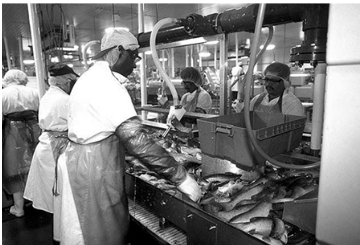
Catfish produced from ponds are delivered fresh to plants for processing into fillets for market.

research program in Stoneville is an applied breeding program that utilizes traditional selective breeding approaches and incorporates new genetic biotechnologies like gene mapping and marker assisted selection. This problem-solving approach to catfish breeding has been focusing on developing catfish germplasm with increased growth, feed efficiency, reproductive success, processing characteristics, and disease resistance.