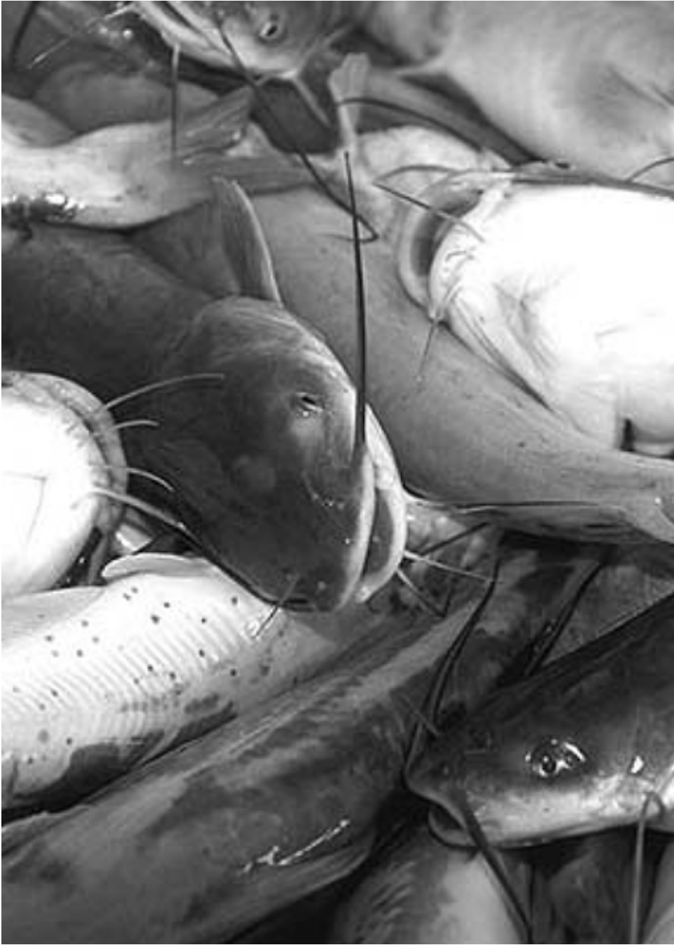
Catfish produced from warmwater culture ponds in the Mississippi Delta.

Although fish farming has been practiced for centuries, only limited fish breeding or genetic improvement has occurred. Research on channel catfish genetics and breeding began at universities in the late 1960's and early 1970's. However, because of the lack of a sustained long-term breeding program, applications of genetic improvement in channel catfish culture have not had significant industry impact.