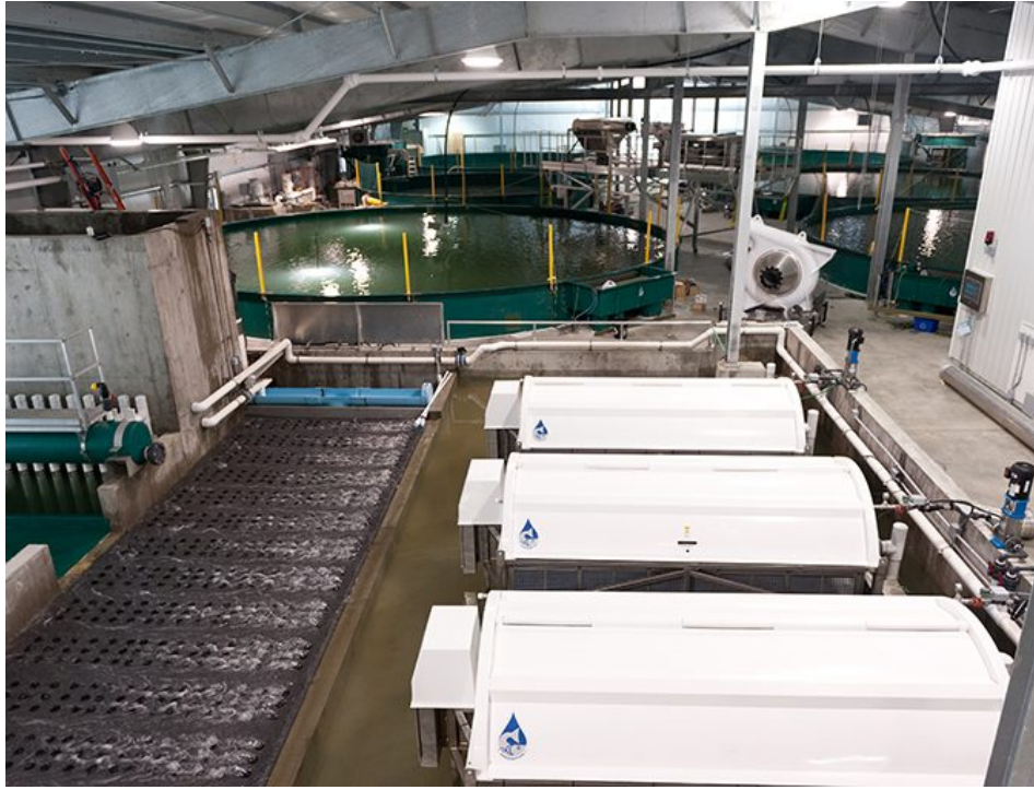
View of the water treatment area of Kuterra LLC, a commercial RAS facility near Port McNeill, BC, Canada. Note the array of 500-cubic-meter culture tanks in the background, and the fish pump and mobile grader station.

Practical, effective training is critical and often hard to come by for owners, operators and even designers of large land-based closed-containment facilities that use water recirculating aquaculture systems (RAS). In fact, as large salmon farming companies are now investing heavily into increased RAS production of smolts and post-smolts across northern Europe and North America, there is arguably a shortage of trained farm operators and managers to run these systems.