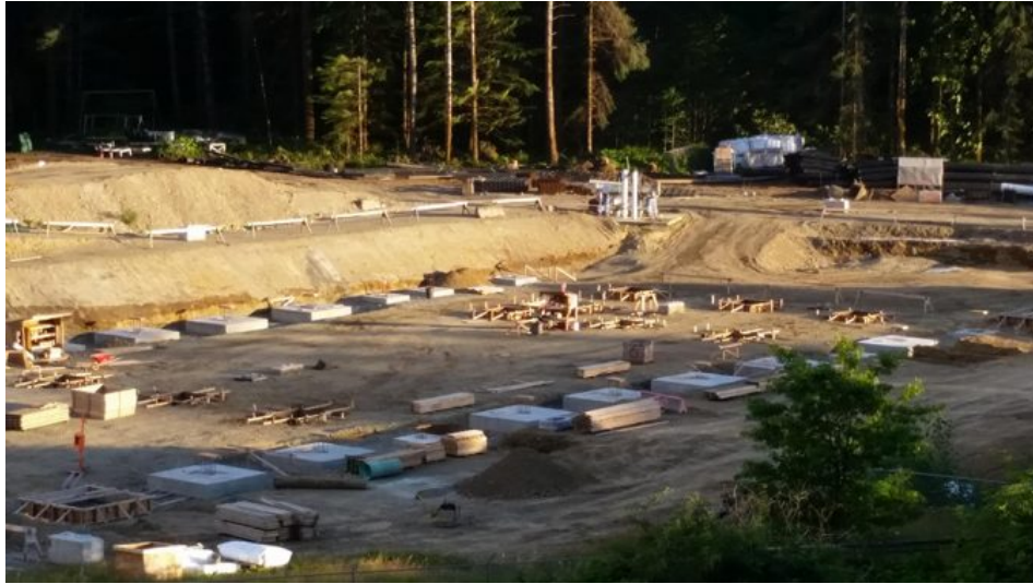
New RAS facility under construction at existing smolt hatchery in British Columbia Canada.

It is also relevant to mention that fish farms are contending with increasingly stringent pollution discharge regulations and diseases in open systems, whether these are open flow-through systems or floating tank systems. In contrast, closed containment RAS operations provide a controlled environment for fish production that, when managed properly by proficient operators, can reduce or eliminate many of these constraints.