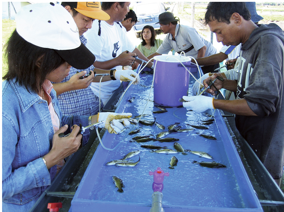
Injection vaccination protect barramundi fingerlings against Streptococcus iniae infections.

Barramundi ( Lates calcarifer ) have recently been considered a suitable aquaculture candidate to become a large-scale seafood commodity. Indeed, several large investment firms are betting on this tasty fish, which can be grown with relatively little environmental impact, to become an economic sensation. As with other marine fish, adequate husbandry and fish health management are challenges that will determine the success or failure of these barramundi projects.