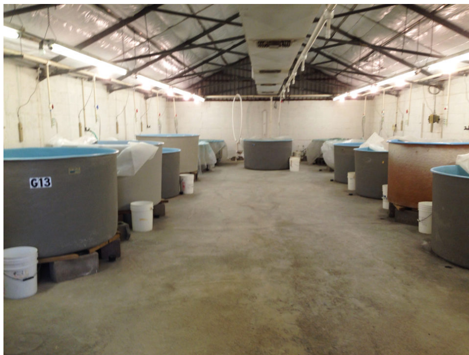
Fig. 1: The APL-WCAC SPF housing facility.

Three sizes of tanks are primarily used in the work performed at APL-WCAC: large fiberglass tanks (1,000-1,600 liters) and two sizes of glass aquaria (90 liters and 37 liters). Twelve 1,000-liter to 1,600-liter round fiberglass tanks are used solely for holding primary quarantine stocks (Fig. 2). An additional 38 1,000- to 1,600-liter fiberglass tanks are used in research projects or for running large-scale challenges with shrimp ranging in size from post larvae to adults.