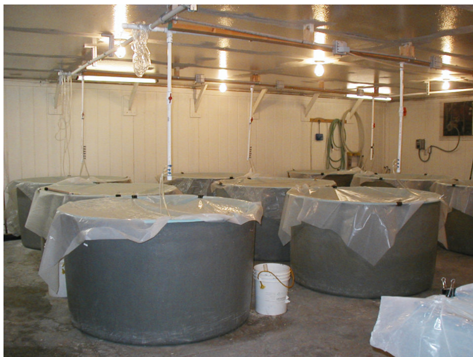
Fig. 2: AQ view of the interior of the primary quarantine facility.

Three sizes of tanks are primarily used in the work performed at APL-WCAC: large fiberglass tanks (1,000-1,600 liters) and two sizes of glass aquaria (90 liters and 37 liters). Twelve 1,000-liter to 1,600-liter round fiberglass tanks are used solely for holding primary quarantine stocks (Fig. 2). An additional 38 1,000- to 1,600-liter fiberglass tanks are used in research projects or for running large-scale challenges with shrimp ranging in size from post larvae to adults.