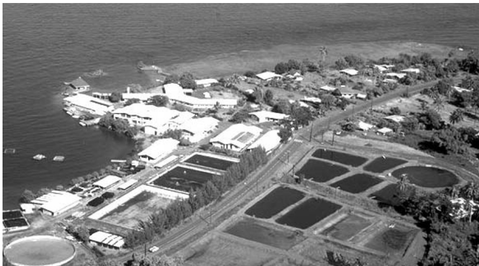
IFREMER facilities in Tahiti (French Polynesia); Centre Océanologique du Pacifique.