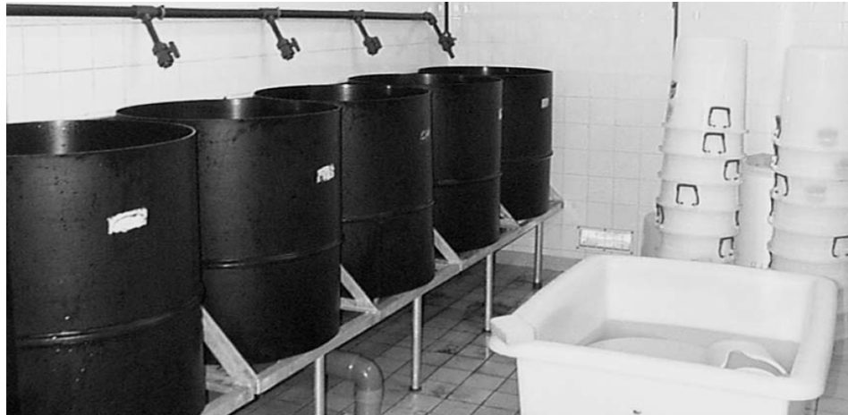
Experimental disease challenge room.

In fact, these domesticated strains could be of great interest for their breeding value and their health status: they could be used by a private foreign breeder to develop improved commercial hybrids. They could also be used as stabilized control lines because inbreeding has reduced drastically their genetic variability.