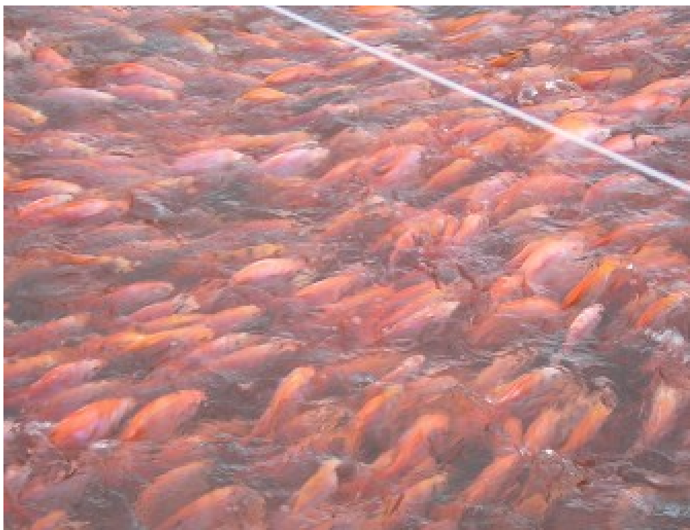
Tilapia, along with trout, currently are the main farmed species in Colombia.

Quality standards are voluntary ones adopted and implemented by agricultural producers worldwide, responding to a commercial requirement to remain in that market. In the case of Colombian aquaculture, the production of tilapia and trout constantly faces this requirement in its trade negotiations with the United States, Canada, the European Union and Peru. This is why FEDEACUA undertook the development of this comprehensive program to improve the competitiveness of its inland fish farming sector, through the implementation of a technology package.