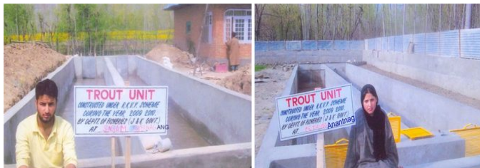
Farmers with their new trout raceways in Kashmir.